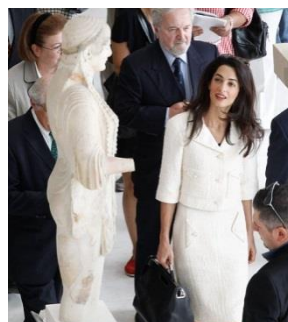
Mrs Clooney during her visit

Mrs Clooney has been greeted with the sort of fanfare normally reserved for Hollywood stars like her husband since landing in Athens. On Wednesday she was mobbed by around 100 cameramen, photographers and reporters when she arrived at the Acropolis Museum, wearing a cream cropped jacket and pencil skirt by Chanel. But she looked every inch the international lawyer when she arrived at the press conference. With a pair of earphones clamped to her head to provide translation of Greek into English, she sat behind a long desk with a heavy black ring-binder file open in front of her, diligently taking notes whenever Greece's culture minister spoke. She and Geoffrey Robertson QC, her boss at London's Doughty St Chambers, were first asked by the Greeks for advice on the contentious issue in 2011.