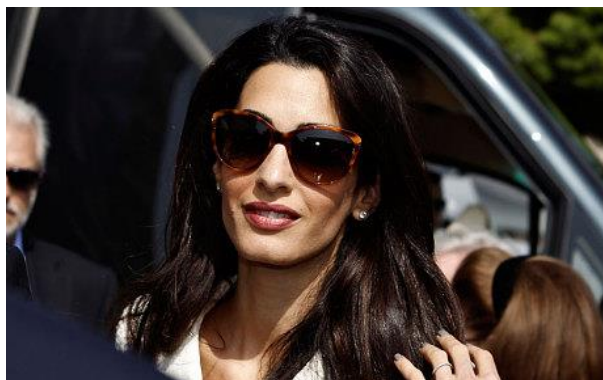
Mrs Clooney arrives at the Acropolis Museum

According to her official schedule, the British lawyer was to have climbed up to the Parthenon, which was built on top of the Acropolis in the fifth century BC in honour of the goddess Athena, at 4pm local time, after a press conference at the Acropolis Museum. Mrs Clooney turned up to the museum impeccably dressed in a cream cropped jacket and pencil skirt by Chanel. She was in high heels, prompting speculation among the Greek press that later she perhaps gazed at the dusty, rock strewn path leading up the steep flanks of the citadel and thought better of attempting the climb. The prospect of being trailed by dozens of photographers, cameramen and reporters under a hot autumn sun probably did not appeal very much either. She had, at least, seen the friezes, known in Britain as the Elgin Marbles, during a guided tour of the ultra-modern Acropolis Museum led by its director and Greece's culture minister.