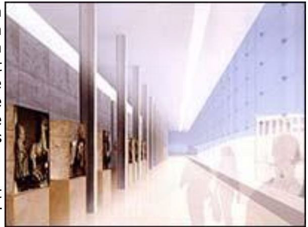
The controversial new museum

The Greeks are building a new museum in which they want to unite their own Parthenon sculptures with those held in London and around the world at the foot of the Acropolis - within sight of the Parthenon temple itself. And they have been praised for the recent cleaning of the slabs taken down from the Parthenon's west frieze in 1983.