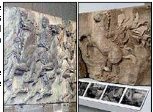
Parts of the frieze in London, left, and in Athens

But when the museum finally opens, surely we will know then that whatever has happened in the past, the London carvings will be safe in Athens?