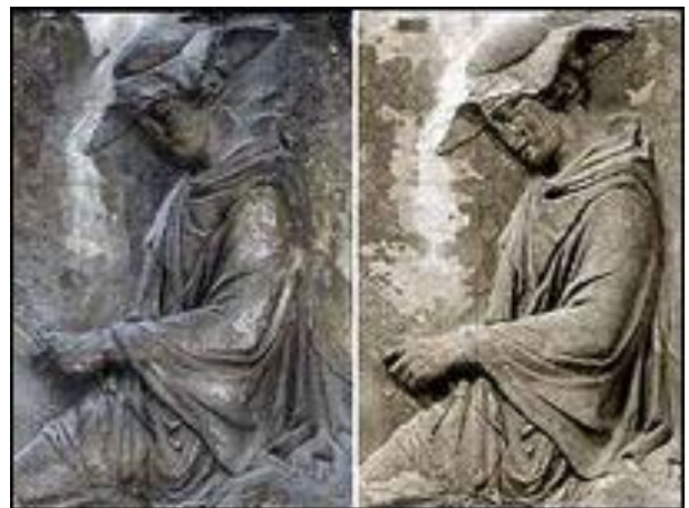
Athens puts cleaned west frieze on display

Is she confident that the British will resist calls to send the marbles back to Athens? "Who knows what's going to happen in the future? I like Athens so if they did go back it would just be an excuse to go."