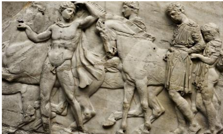
The Parthenon marbles – among the world's most luminous, beautiful art.

These consummately beautiful sculptures demand a proper setting – and a trip to Athens has convinced me the Acropolis Museum is that place.