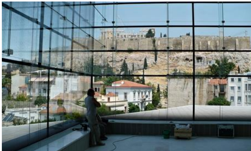
Greece's new Acropolis Museum.

The sad truth is that in the British Museum, the Parthenon sculptures are not experienced at their best. For one thing, they're shown in a grey, neoclassical hall whose stone walls don't contrast enough with these stone artworks – it is a deathly space that mutes the greatest Greek art instead of illuminating it. So if the British Museum wants to keep these masterpieces it needs to find the money to totally redisplay them in a modern way.